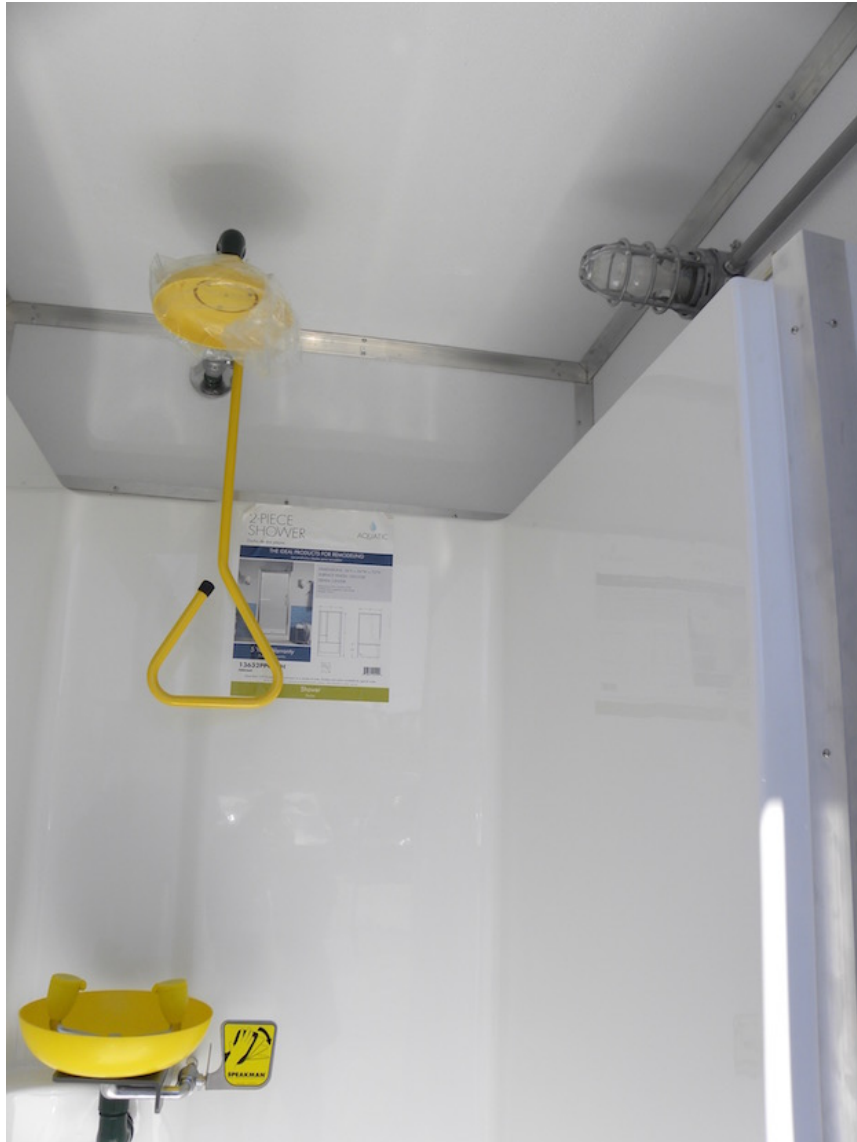
Combination Safety Shower and Eyewash Station