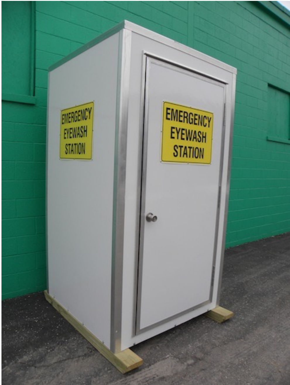
4848 EW Exterior View Stand Alone Eyewash /Shower